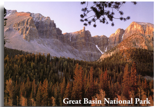
Great Basin National Park

This morning, following an included breakfast we continue south into Nevada's " Great Basin ". A stop in McGill at the McGill Drug Store Museum will take you back to an era gone but not forgotten. This afternoon we arrive in the former copper mining town of Ely , the largest city in western Nevada, and at the heart of Nevada's " Pony Express Territory " – an area of ghost towns, long forgotten cemeteries, and abandoned mines. Its name reflects the fact that the historic Pony Express route stretched through this region in the early 1860s. Ely is known for their collection of murals. Blank walls of the downtown buildings have been painted by world-renowned artists with colorful scenes from the town's rich past. We'll visit the famous Nevada Northern Railway Museum and the historic East Ely Depot . The museum offers a unique view of the railyards and historic rolling stock of the Nevada Northern Railroad. All aboard for a ride on the legendary Ghost Train of Old Ely up a narrow mountain canyon. Step back in time on this historic train ride and learn why this is called a "ghost train." This evening, a " jailhouse " dinner in a captivating location. (Breakfast, Dinner)