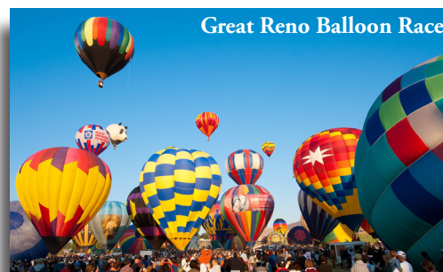
Great Reno Balloon Race

Rise and shine early this morning as we make our way to the balloon field (with boxed breakfast enroute) for the mass ascension of balloons at the Great Reno Balloon Race . Looking around you'll see acres of billowing fabric, gently introducing panels of vibrant color into the landscape. As hot air encompasses the material, the liftoff begins and your spirits ascend with more than 100 hot air balloons as they take flight into the Reno skies creating a rainbow of colorful balloons soaring about. Then, the excitement really heats up as the skill competitions begin. There is a skill to “racing” a balloon and there is much more than meets the eye! Enjoy the afternoon at leisure. Tonight, we'll enjoy an included dinner in a Basque restaurant with a traditional family-style served meal. (Breakfast, Dinner)